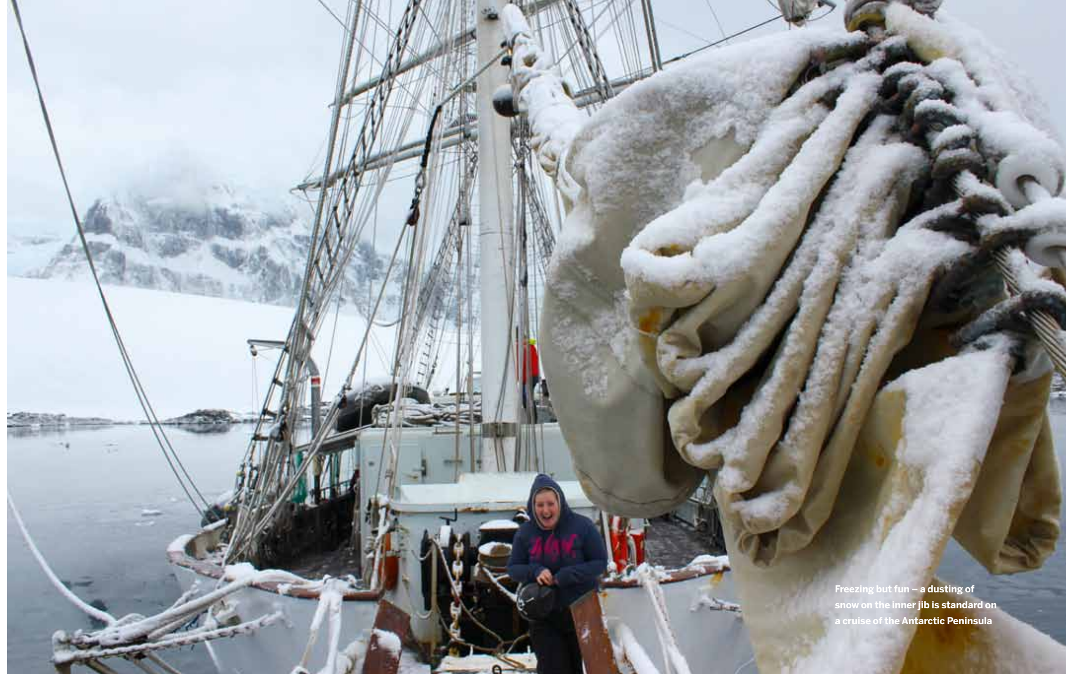
Freezing but fun – a dusting of snow on the inner jib is standard on a cruise of the Antarctic Peninsula

running repairs beyond the capabilities of the voyage crew and were instrumental in providing muscle for landings.