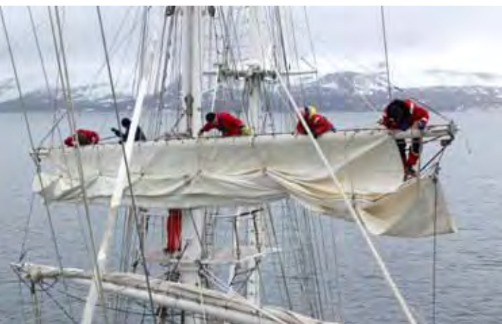
▲ Above (left-right): furling sails in the caldera at Deception Island; the ship is cleaned six days a week during 'Happy Hour' after breakfast