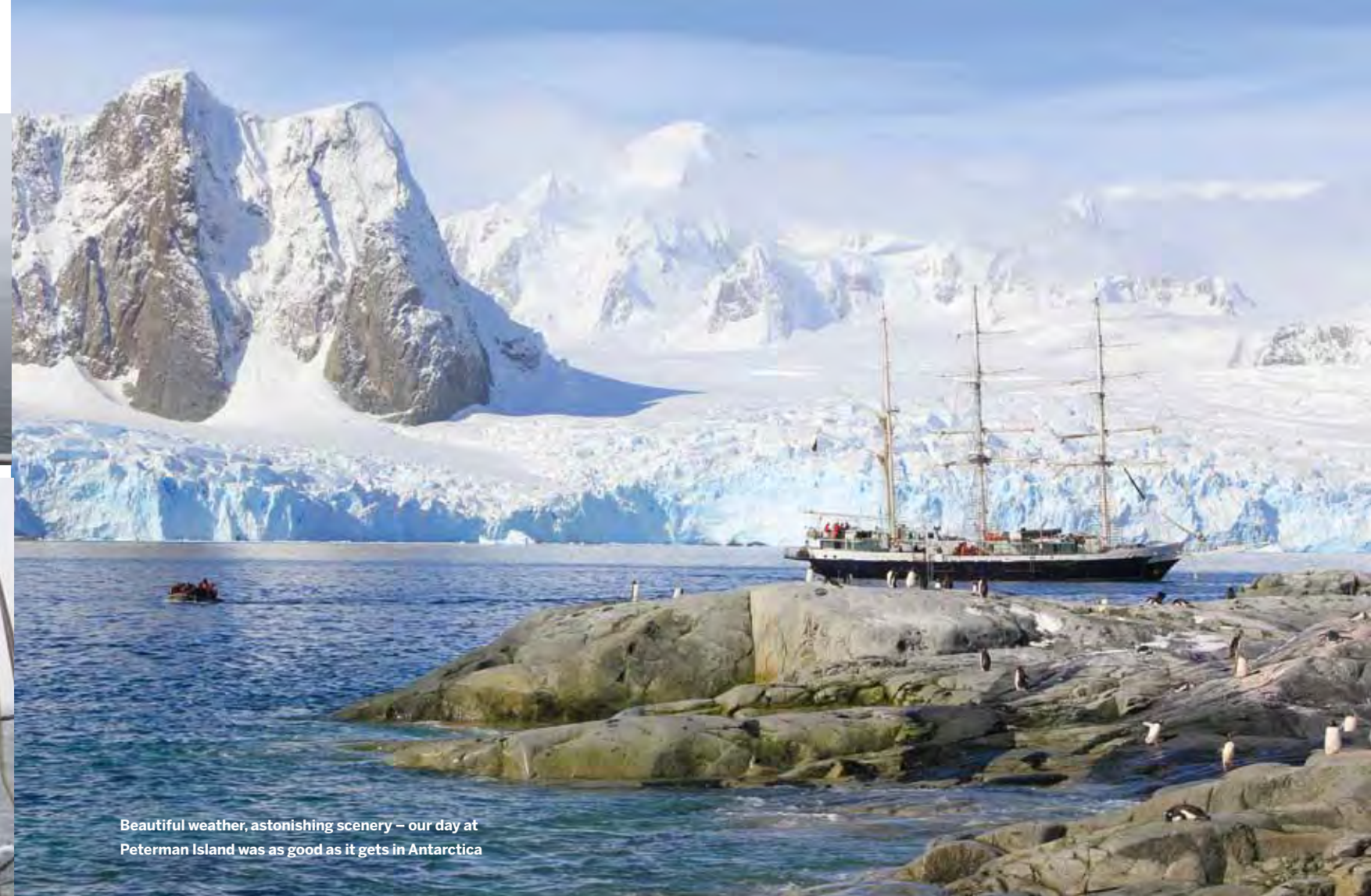
Beautiful weather, astonishing scenery – our day at Peterman Island was as good as it gets in Antarctica

I'm not one to pass up the opportunity to climb out of my comfort zone. But on 5 March I occasionally questioned my judgment. Just west of the South Shetland Islands in the Antarctic, I found myself in a Force 10 northerly. The barometer had slid to 971mb and the barque Lord Nelson was getting it on the nose on our homeward passage to Ushuaia. It had been a memorable morning.