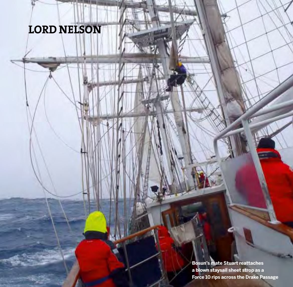
Bosun's mate Stuart reattaches a blown staysail sheet strop as a Force 10 rips across the Drake Passage