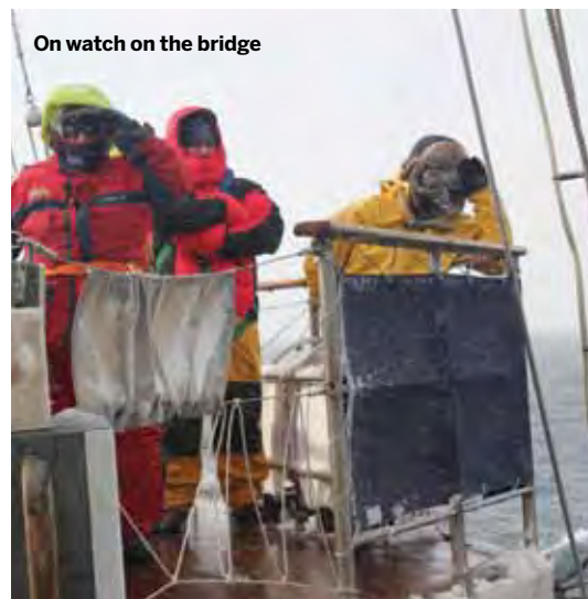
On watch on the bridge