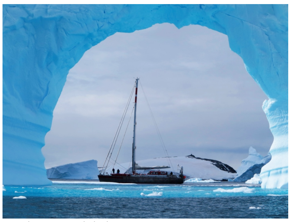
Ice arch near Hovgaard Island

In 2013, after five expeditions to the sub-antarctic island of South Georgia, I finally got to the actual Antarctic mainland, with Skip Novak, the owner of the 74 foot yacht Pelagic Australis . Together we led a nine person team making ski ascents on the western side of the Peninsula. I enjoyed the trip so much that I immediately booked Pelagic Australis for the next available slot on the Peninsula – January 2016. Now I need eight keen people to fill the boat and make the expedition happen.