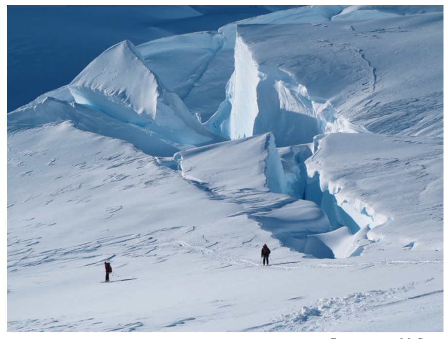
Crevasses on Mt Scott

This beautiful multisummited peak dominates the landwards side of the Penola Strait. There are some interesting technical routes on the seaward face,