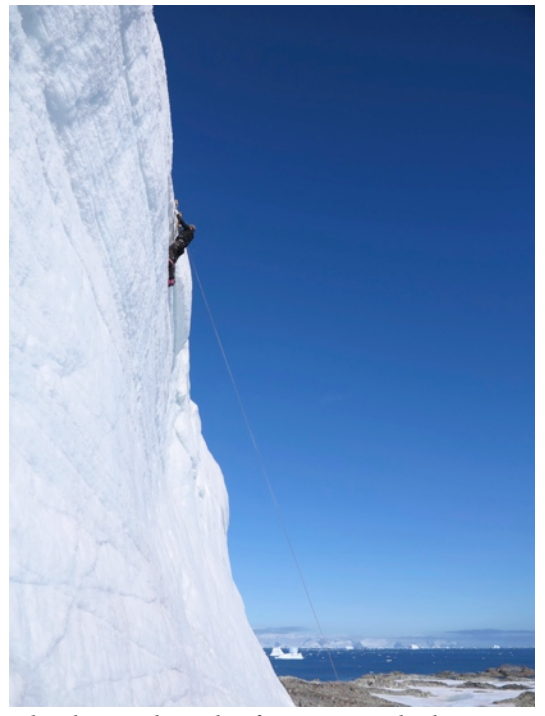
The skipper doing his first everice climb, near Vernadsky Base

day's introductory ice climbing. Apart from good health and a willingness to live for four weeks at fairly close quarters with up to fourteen people, no special qualifications are required. Pelagic crews are aways extremely experienced and pride themselves on organizing interesting shore trips.