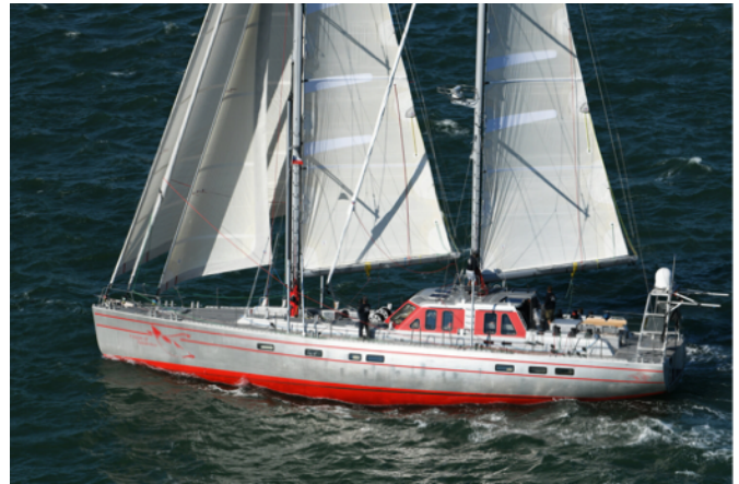
Vinson of Antarctica.