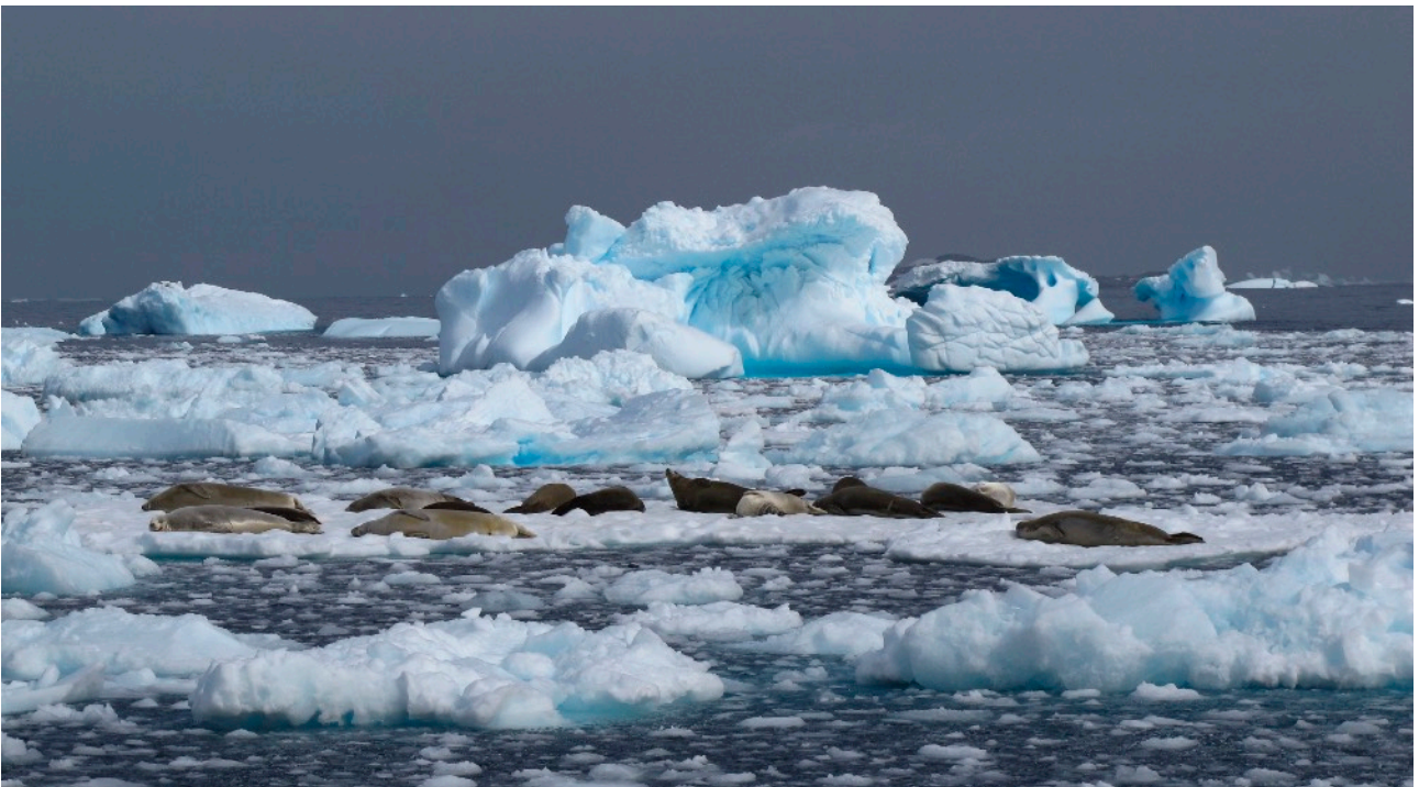
Crabeater seals in Penola Strait.

only equipment you will need – apart from a camera with many Gigabytes of memory – is standard cold weather protective clothing and warm boots. (Pelagic Expeditions provides foul weather sailing gear). Again, if you sign up for the expedition I will send a full kit list and can advise you about helpful suppliers.