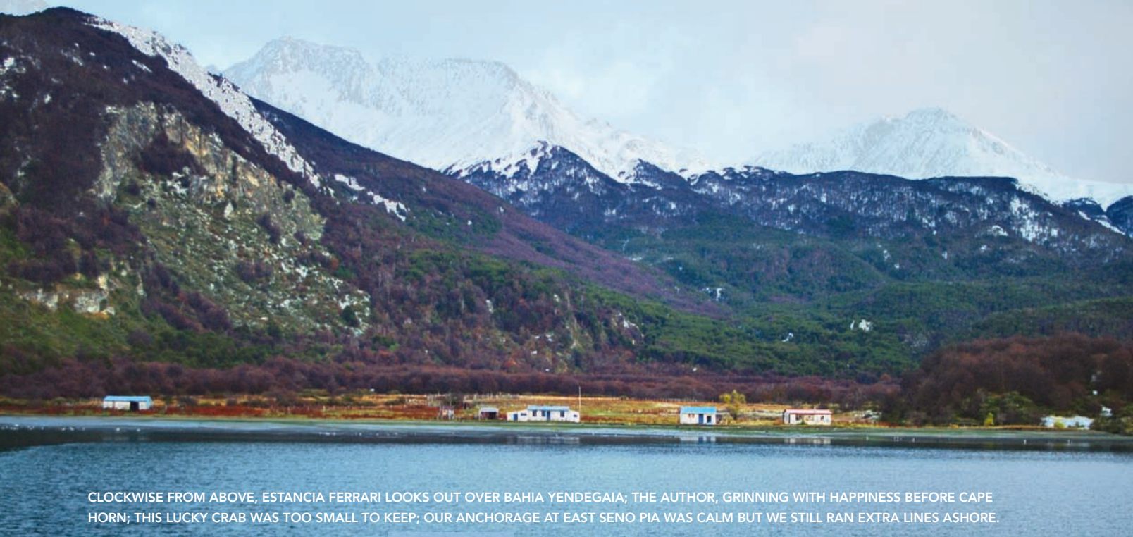
CLOCKWISE FROM ABOVE, ESTANCIA FERRARI LOOKS OUT OVER BAHIA YENDEGAIA; THE AUTHOR, GRINNING WITH HAPPINESS BEFORE CAPE HORN; THIS LUCKY CRAB WAS TOO SMALL TO KEEP; OUR ANCHORAGE AT EAST SENO PIA WAS CALM BUT WE STILL RAN EXTRA LINES ASHORE.