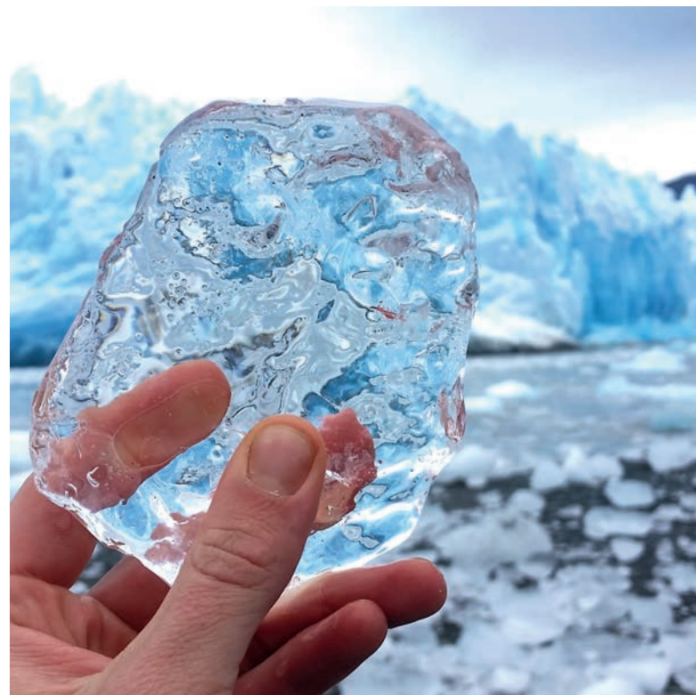
RIGHT: crystal clear ice from the mouth of a retreating glacier

I took the younger members of the guest party on a typically wet hike through the woods and up to a glacial lake at 300m that gave a fine view down to the yacht. While