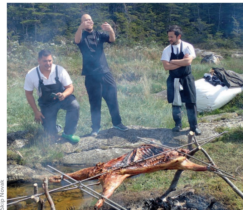
ABOVE: asado, or barbecue, on an island in the fjord of Seno Pia. Mutton carcass had been cured in the open air, hung from a padeye on Aquijo's foremast