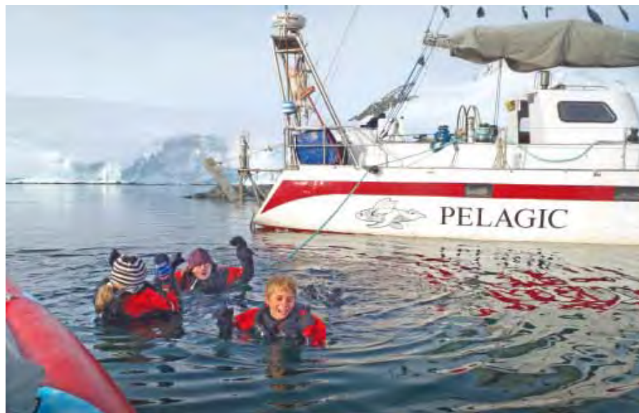
'Bobbing' - swimming in drysuits and buoyancy aids - was one of our favourite things in harbour