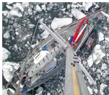
Pelagic is a 54ft (16.5m) steel sloop with a lifting keel and rudder for high-latitude sailing