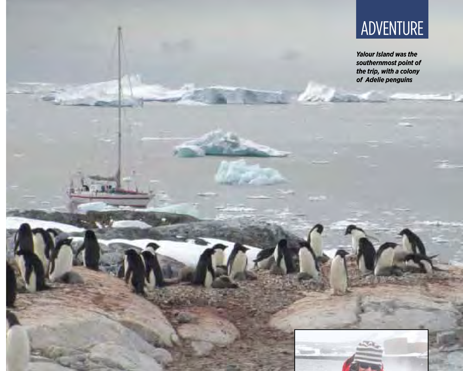
Yalour Island was the southernmost point of the trip, with a colony of Adelle penguins