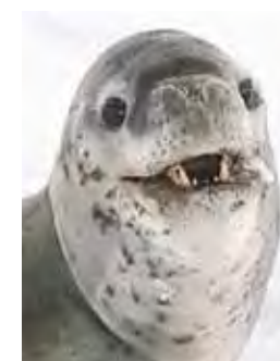
The Antarctic's top predator, a leopard seal

Eventually it was time to say goodbye to the women at Port Lockroy base and sail even further south, to Yalour Island, which has a colony of Adelle penguins. These are really funny creatures because they have a kind of afro hairdo. My dad's friend from Oxford University is doing a research project on penguins, and he has a camera