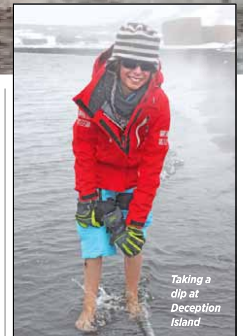
Taking a dip at Deception Island