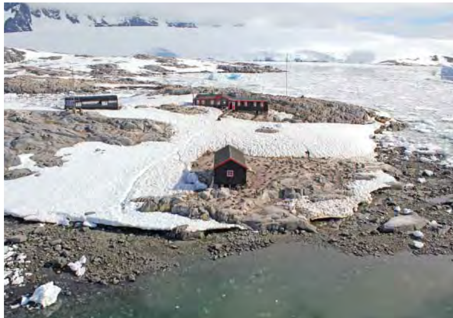
The hill above Port Lockroy made a great campsite and gave stunning views across the bay