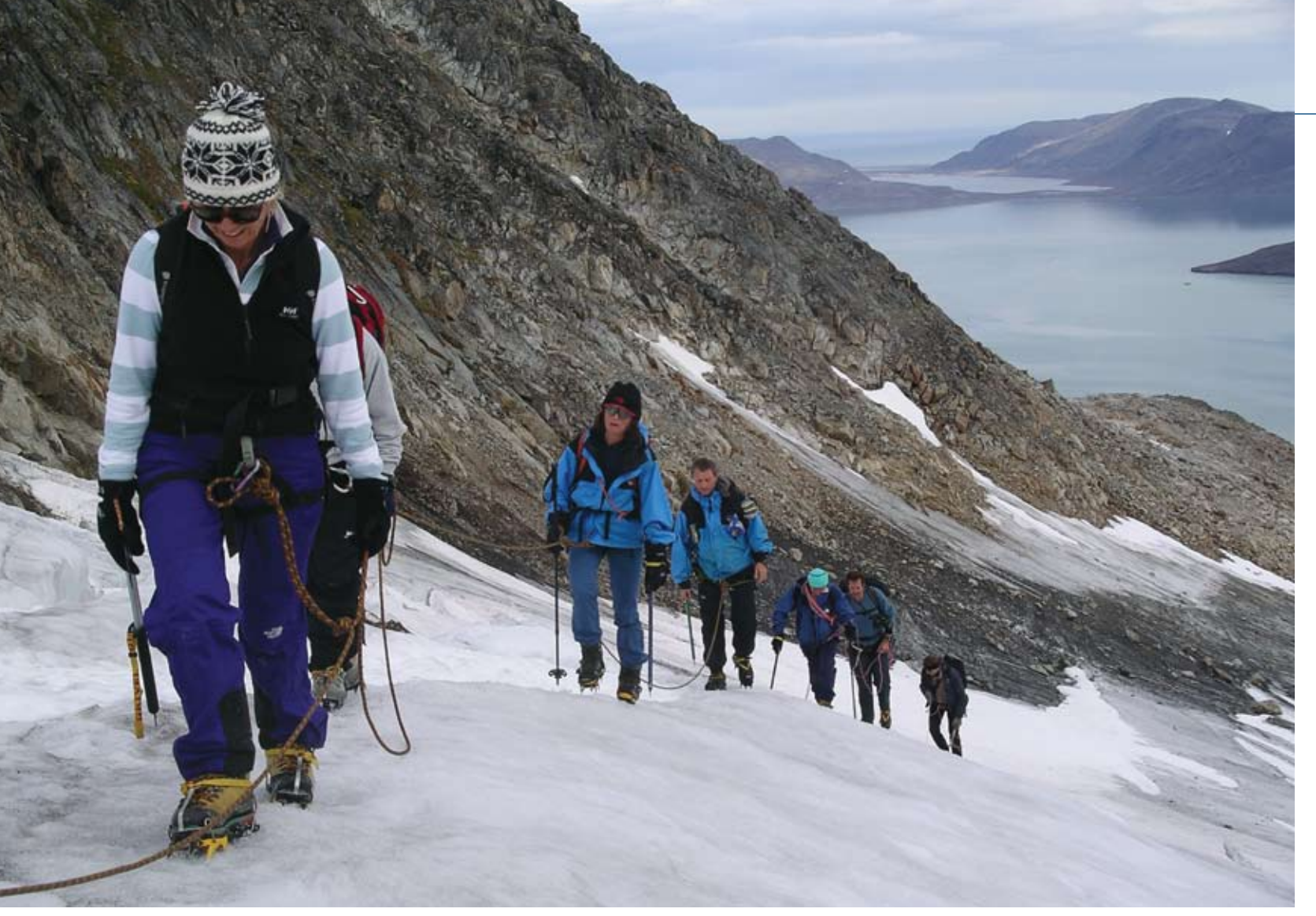
The Shackleton Traverse: Six of us on skis and skins were off up the mountain, pulling sleds with tentage, safety equipment, food and fuel for five days.

It was bright and sunny as we walked through bull fur seals staking out their mating territory, the occasional King penguin standing guard. With Pelagic Australis standing by, we jogged offshore. The skipper and crew met us in the Zodiac<sup>®</sup> for tea and biscuits.